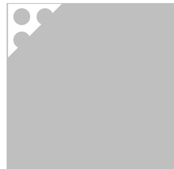
ORAFLEX® 11883 firm