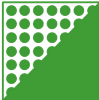
ORAFLEX® 11856 medium